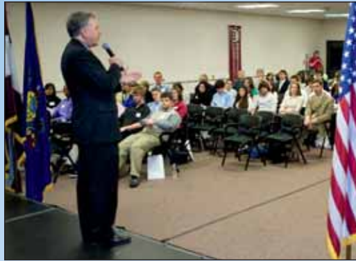
Senator Rafferty, serving as "Lieutenant Governor" for the day, addresses the student "Senators" during his annual Seminar for Future Leaders.

The best way to learn about the legislative process is to participate in it. The Seminar for Future Leaders, now in its sixth year, offered the students a first-hand opportunity to develop legislation, debate