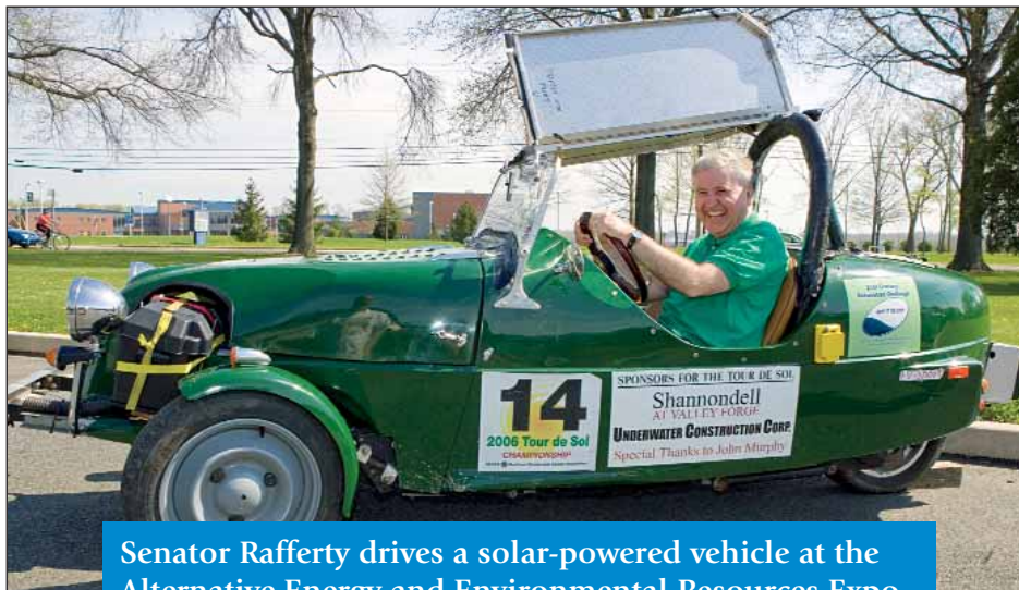
Senator Rafferty drives a solar-powered vehicle at the Alternative Energy and Environmental Resources Expo.

Each exhibitor made a commitment to encourage a positive environmental stewardship through action and community interaction.