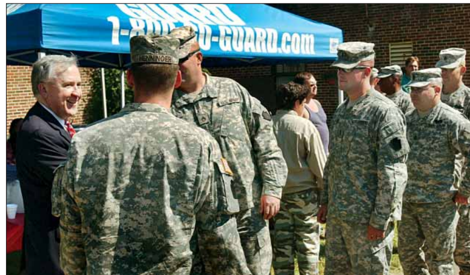
Senator Rafferty meets with Army National Guardsmen at the Spring City Armory upon their return from a year-long tour of duty in Iraq.

The American Legion and VFW posts were a part of the welcoming committee.