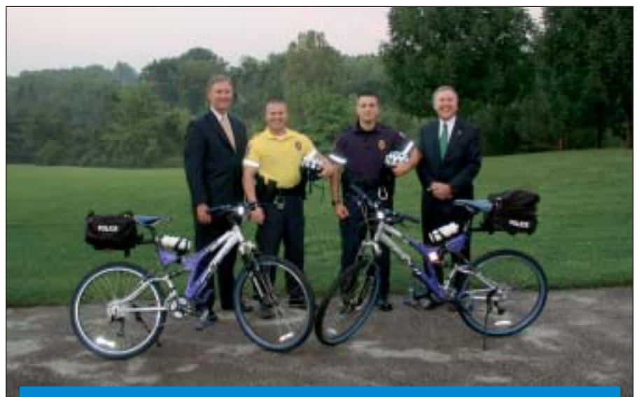
Senator Rafferty views the new Lower Providence Township Police Department bikes that were purchased with a state grant from Senator Rafferty.