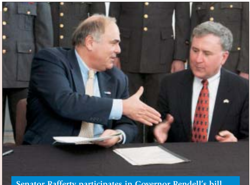
Senator Rafferty participates in Governor Rendell's bill signing ceremony of Senate Bill 877 at the Embreeville State Police Barracks.

The Senate is considering action to place a cap on non-economic damages, better known as "pain and suffering" awards. Without reasonable "caps," doctors and hospitals face the possibility of huge jury awards that could put them out of business. I have cosponsored legislation that would put the question to the voters for their decision.